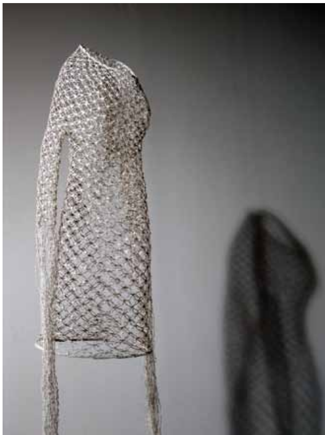
Nithikul Nimkulrat (2005). Get Sorted , hand manipulated and knotted paper string.